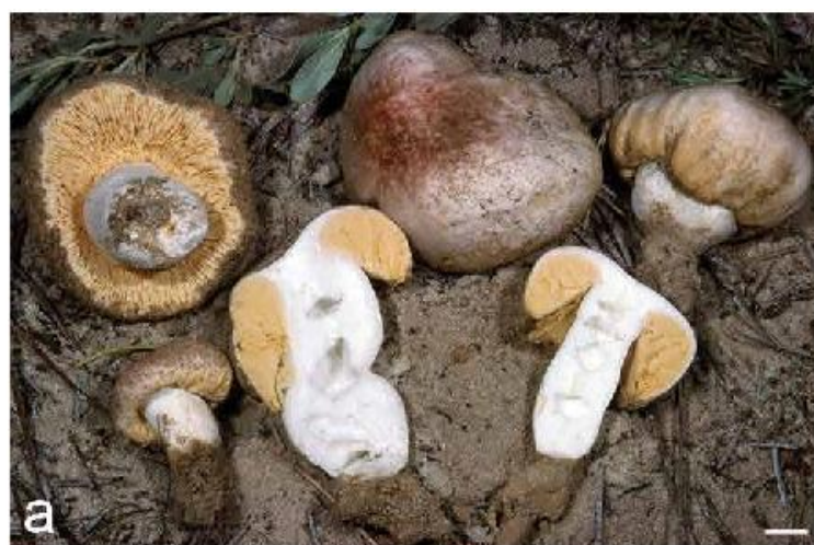
Figure 2: Truffle-like Russulaceae wishlist; Russula vinaceodora .