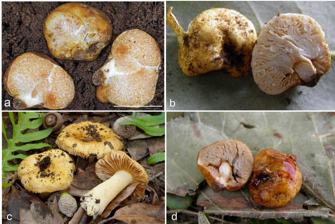
Figure 1: Truffle-like Russulaceae wishlist; a) Russula meridionalis , b) R. messapica var. messapicoides , c) R. messapica var. messapica , d) R. messapica var. messapicoides , illustrating the red discoloration of the pileus with KOH.