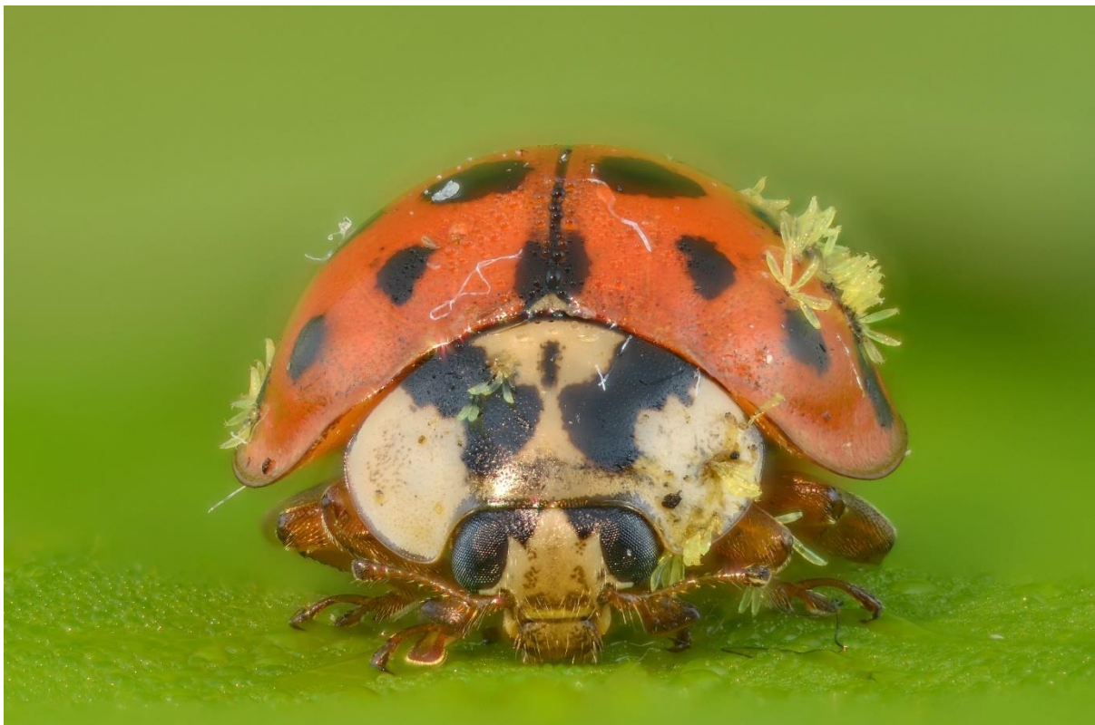
Fig. 1. A harlequin ladybird ( Harmonia axyridis ) infected with Hesperomyces harmoniae . (photo Gilles San Martin).

Hesperomyces – green beetlehangers – have the appearance of small banana-shaped protrusions (thalli) on the outside of a ladybird (Fig. 1), which can be seen with the naked eye if mature. A mature thallus is between around 0.3 and 0.7 millimetres in length, and has a green to yellowish, translucent colour. If looked at under a microscope, you can see that it has a black tip (the foot) where the thallus is attached to the ladybird (Fig. 2). Mature thalli have antenna-like lobes on top of the thallus. The thallus is filled with elongated two-celled ascospores, which eject when the thallus comes into contact with another surface – such as another ladybird. Typically, Hesperomyces is transferred between individual hosts by touch, for example when the ladybirds mate or huddle together during hibernation. The easiest way to see Hesperomyces is usually on the outside of the elytra (hardened forewings, usually the most colourful) of the ladybird, but can grow anywhere on the outside of its host. There can be many, but also only a few thalli present.