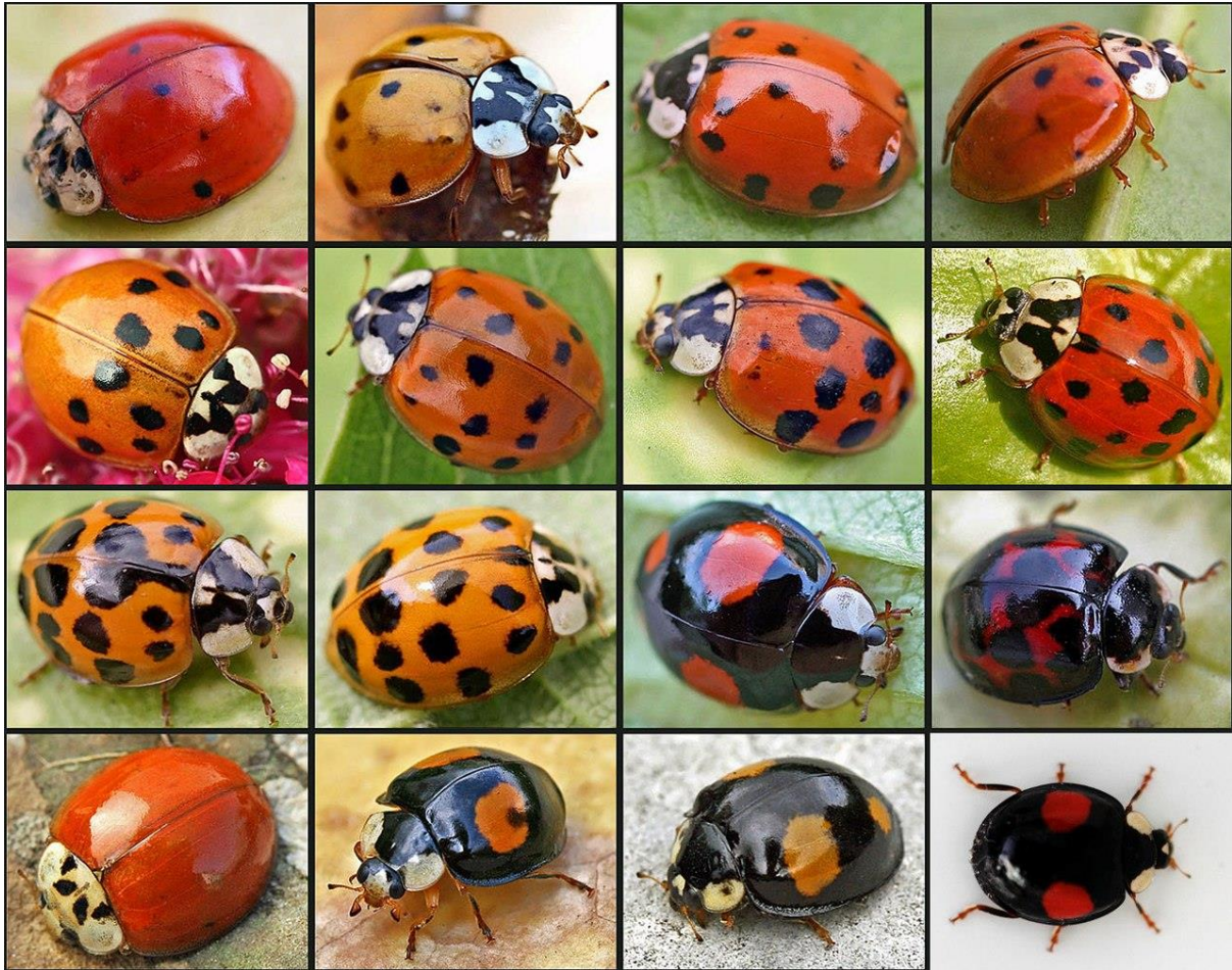
Fig. 3. The many forms of Harmonia axyridis , the harlequin ladybird.

In addition to harlequin ladybirds, other species Hesperomyces can also be found on other ladybird hosts, such as the two-spot and ten-spot ladybird ( Adalia bipunctata and Adalia decempunctata ), orange ladybird ( Halyzia sedecimguttata ), spider mite destroyer ladybirds ( Stethorus sp.), among many other ladybird hosts. Many of these are as of yet undescribed species, so if you see a ladybird, check it for fungal infection!